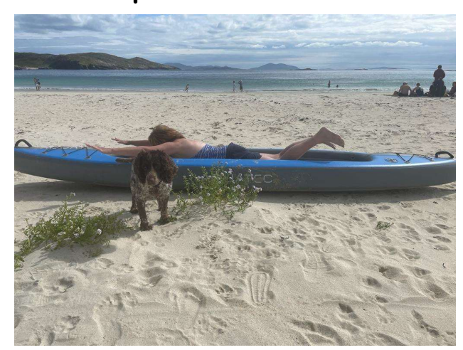
All other entries received will win a small goody bag 😊